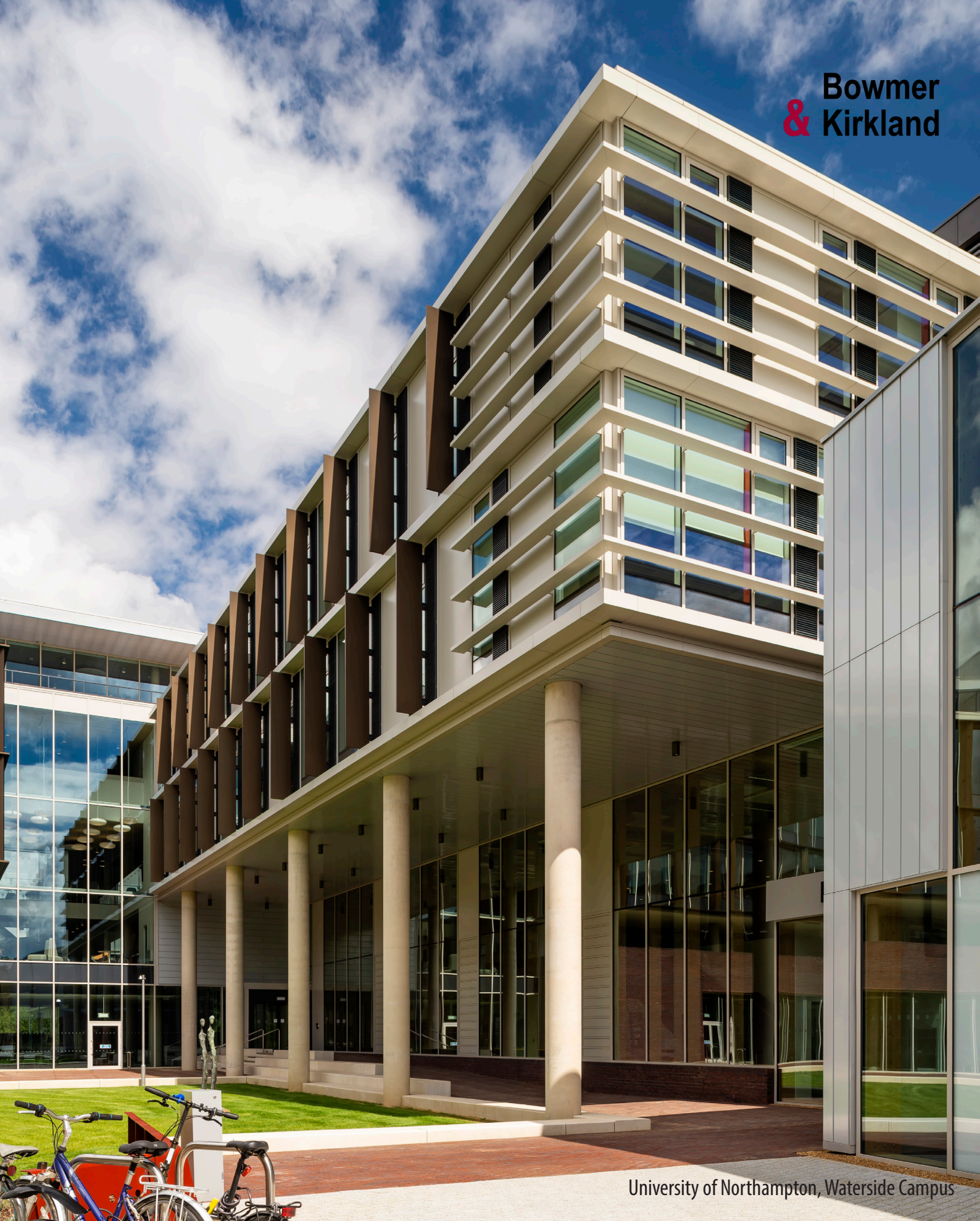
University of Northampton, Waterside Campus